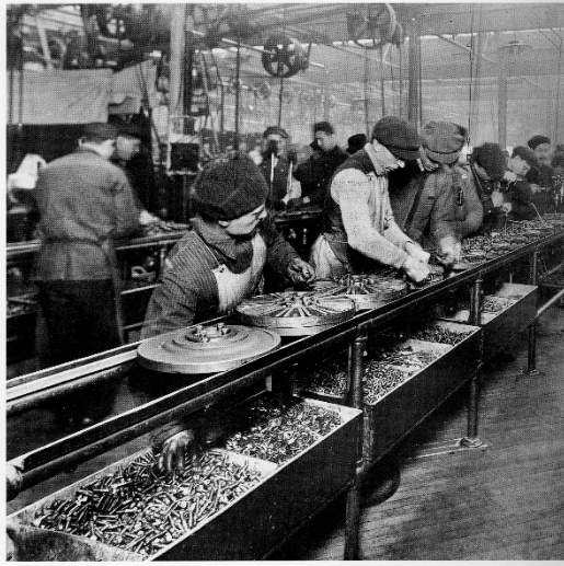
Fly wheel magneto assembly line, circa 1913 (A History of Ford Motor Company, 1992, p.20.)

Henry Ford initiated a new era in industrial history in 1913 when he established the moving assembly line at the Ford plant in Highland Park, Michigan. The men below are working on the first flywheel magneto assembly line.